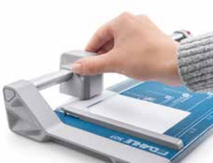
Dahle 507 rotary trimmer (3rd generation) - simple to use with two fingers thanks to improved cutting head ergonomics