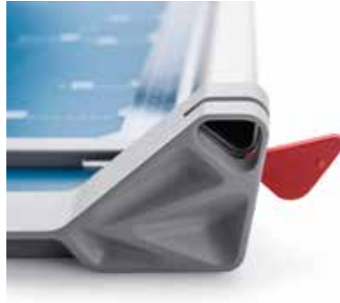
Dahle 507 rotary trimmer (3rd generation) - replace cutting heads easily with undetachable locking mechanism