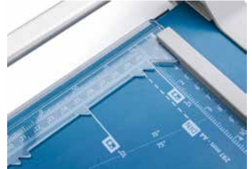
Dahle 507 rotary trimmer (3rd generation) - practical format lines and pressure clamp with markings make it easier to align the material to be cut