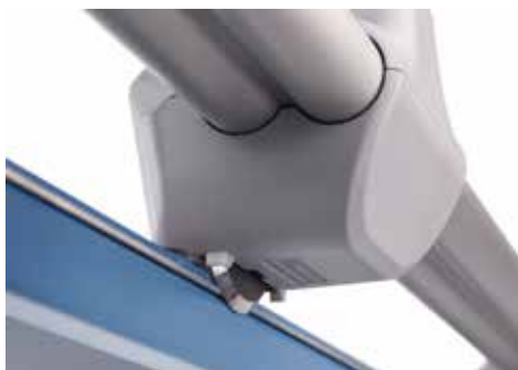
Dahle 558 rotary trimmer (3rd generation) - ground circular blade for precision and burr-free cutting results