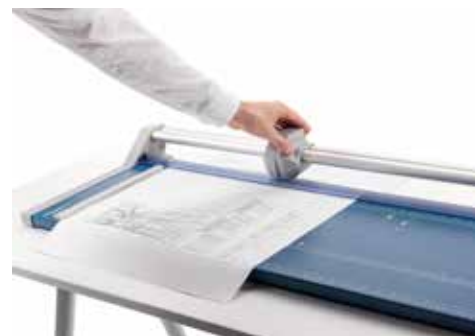
Dahle 558 rotary trimmer (3rd generation) - the cutting head is guided precisely with the ball of the thumb thanks to improved cutting head ergonomics