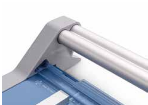
Dahle 558 rotary trimmer (3rd generation) - accurate cutting and durability thanks to double guide bar