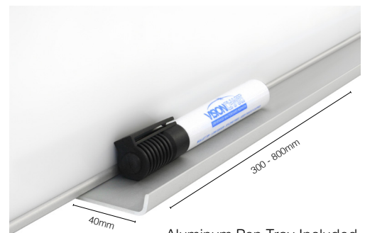
Aluminum Pen Tray Included