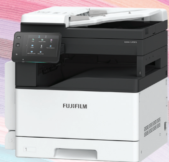
Apeos C2450 S Standard Model